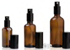
Pump13_La 30ml, 50ml, 100ml