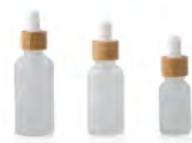
Dropper01_La 15ml, 30ml, 50ml