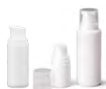
Airless04_Ga 50ml, 100ml, 200ml