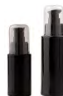
Pump04_La 30ml, 50ml