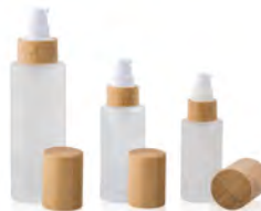
Pump02_La 100ml, 50ml, 30ml