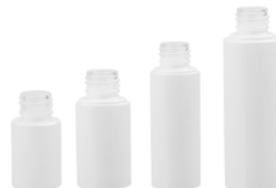
Dropper08_La 10ml, 15ml, 30ml, 50ml