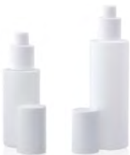
Pump12_La 50ml, 100ml