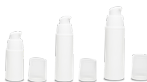
Airless10_Si 15ml, 30ml, 50ml