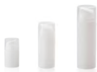
Airless06_La 50ml, 100ml, 150ml