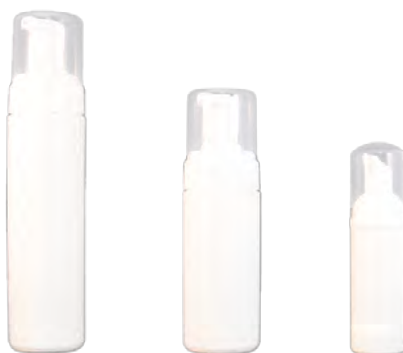
Foamer01_Si 200ml, 100ml, 50ml