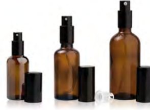
Pump13_La 30ml, 50ml, 100ml