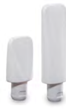
Tube03_Mi 50ml, 100ml