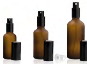
Pump14_La 30ml, 50ml, 100ml