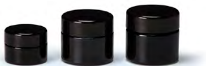
Jar_23_Mi 15ml, 30ml, 50ml