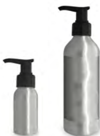
Alu02_Xa 80ml, 100ml, 200ml, 250ml