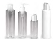
Bottle03_Mi 100ml, 200ml, 250ml