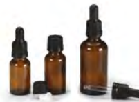
Dropper02_Mi 15ml, 30ml, 50ml