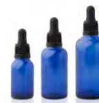
Dropper05_La 15ml, 30ml, 50ml