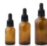
Dropper03_La 15ml, 30ml, 50ml