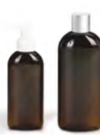
Bottle19_Mi 125ml, 250ml