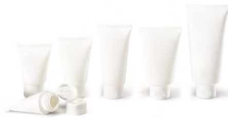
Tube02_Mi 50ml, 75ml, 100ml, 125ml, 200ml