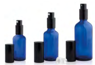
Pump15_La 30ml, 50ml, 100ml