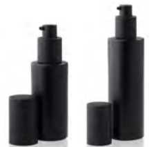
Pump11_La 50ml, 100ml