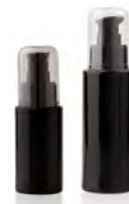
Pump04_La 30ml, 50ml