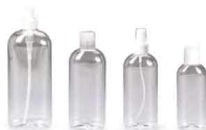
Bottle02_Mi 125ml, 200ml, 250ml, 400ml