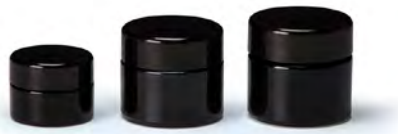
Jar_23_Mi 15ml, 30ml, 50ml