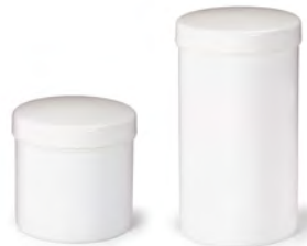
Jarp02_Mi 500ml, 1000ml