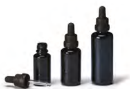
Dropper03_Mi 15ml, 30ml, 50ml