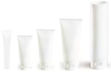
Tube01_Mi 15ml, 30ml, 50ml, 100ml, 200ml