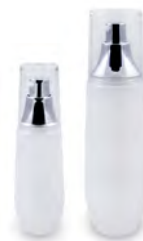
Pump05_La 40ml, 100ml