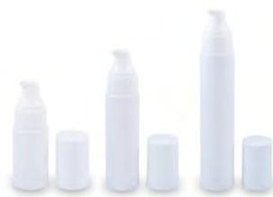
Pump09_La 30ml, 75ml, 100ml