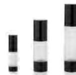
Airless05_La 15ml, 30ml, 50ml