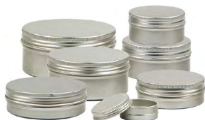
Alu01_Xa 10ml, 50ml, 80ml, 100ml, 150ml, 200ml, 250ml