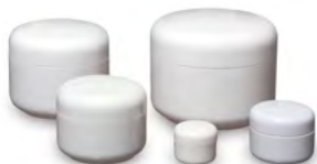
Jar14_Gi 5ml, 15ml, 50ml, 100ml, 200ml