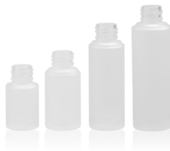
Pump17_La 10ml, 15ml, 30ml, 50ml