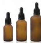
Dropper04_La 15ml, 30ml, 50ml