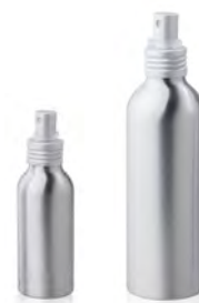
Alu02_La 100ml, 200ml