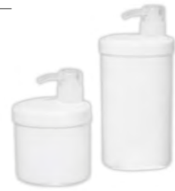
Jarp04_Gi 500ml, 1000ml