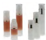
Airless01_Ed 15ml, 30ml, 50ml