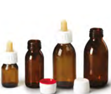
Amber01_Mi 30ml, 60ml, 100ml, 125ml