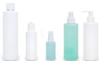
Bottle01_Ed 50ml, 125ml, 200ml, 250ml