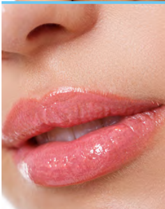
Photo-protection is the most important aspect of skin care and, in fact, the greatest investment one can do for their health and their skin. Helios offers products needed to show off a beautiful tan safely and effectively while offering high powered broad spectrum sun protection.