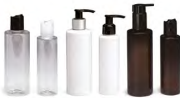
Bottle06_Mi 150ml, 250ml