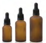
Dropper04_La 15ml, 30ml, 50ml