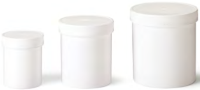
Jarp01_Mi 250ml, 500ml, 1000ml